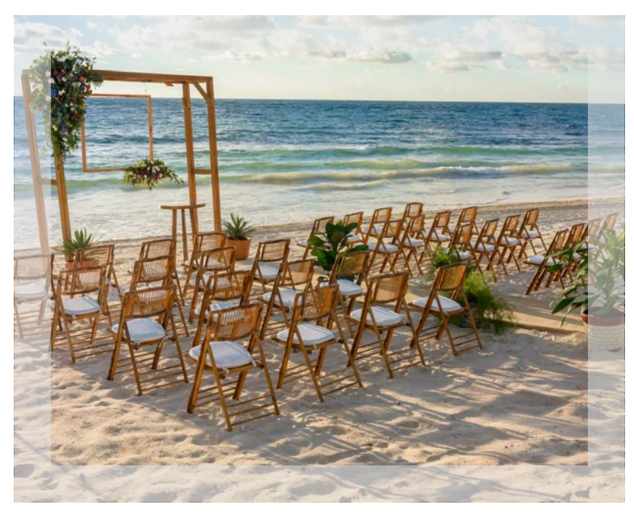
BEACH Wedding ceremony capacity is up to 150 pax.