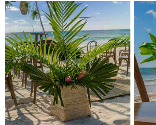
Ceremony structure flowers