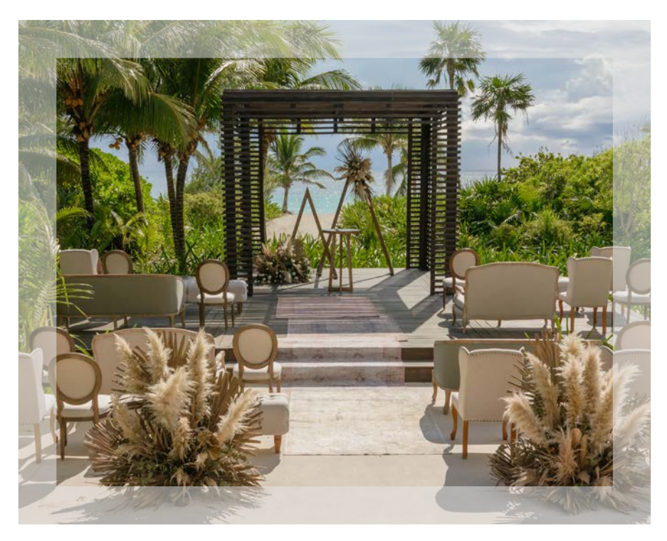
GAZEBO Gazebo capacity is for 80 pax.